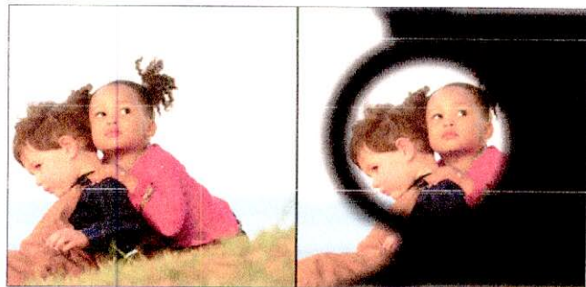
A normal visual field is represented in the image on the left. The image on the right is an example of severely damaged vision.