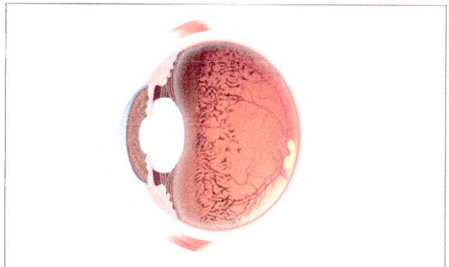
Retina with retinitis pigmentosa

Loss of side vision also makes moving around more difficult, causing noticeable clumsiness from not being able to see objects below and around you. As the outer areas of vision slowly disappear, the condition commonly referred to as "tunnel vision" occurs. Many people retain a wide enough scope of useful vision for a long period of time. In some cases, central vision may be affected first, making detail work difficult, such as reading or threading a needle. This is referred to as macular dystrophy , because the central area of the retina, called the macula , is affected.