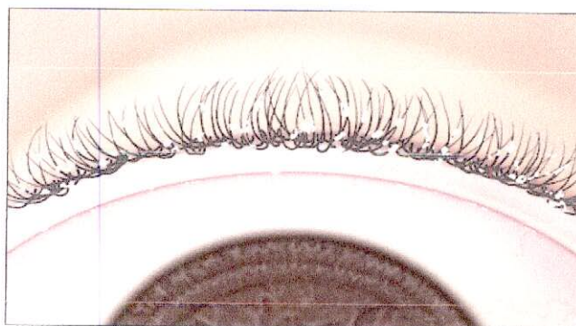
With blepharitis , the eyelids become coated with oily particles and bacteria near the base of the eyelashes.

With blepharitis , both the upper and lower eyelids become coated with oily particles and bacteria near the base of the eyelashes.