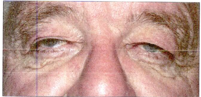
Ptosis is a condition in which the upper eyelid droops.

Involuntary ptosis develops with aging. It may worsen after other types of eye surgery or eyelid swelling. Ptosis may limit your side or even your central vision. If ptosis occurs in one eye, it may create an uneven appearance. Surgical shortening of the muscle that opens the eyelid will often lead to better vision and improved appearance.