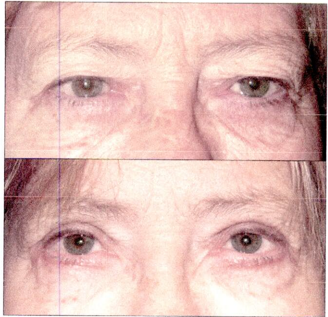
Excess eyelid skin may produce a heavy sensation as well as limit side vision (top); surgery can correct this condition (bottom).

Stretching of the lower eyelid from age may cause the eyelid to droop downward and turn outward. This condition is called ectropion. Eyelid burns or skin disease can also cause this problem. Ectropion can cause dryness of the eyes, excessive tearing, redness and sensitivity to light and wind. Surgery usually restores the normal position of the eyelid, improving these symptoms.