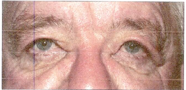
Surgery restores the upper eyelid to its normal position.