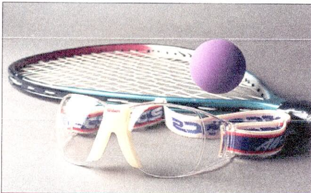
Protective eyewear is recommended for racquet sports.

Increasing numbers of children are participating in sports at an early age. Many sports have official standards for safety equipment.