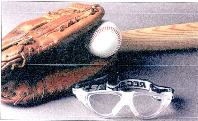
Protective sports eyewear